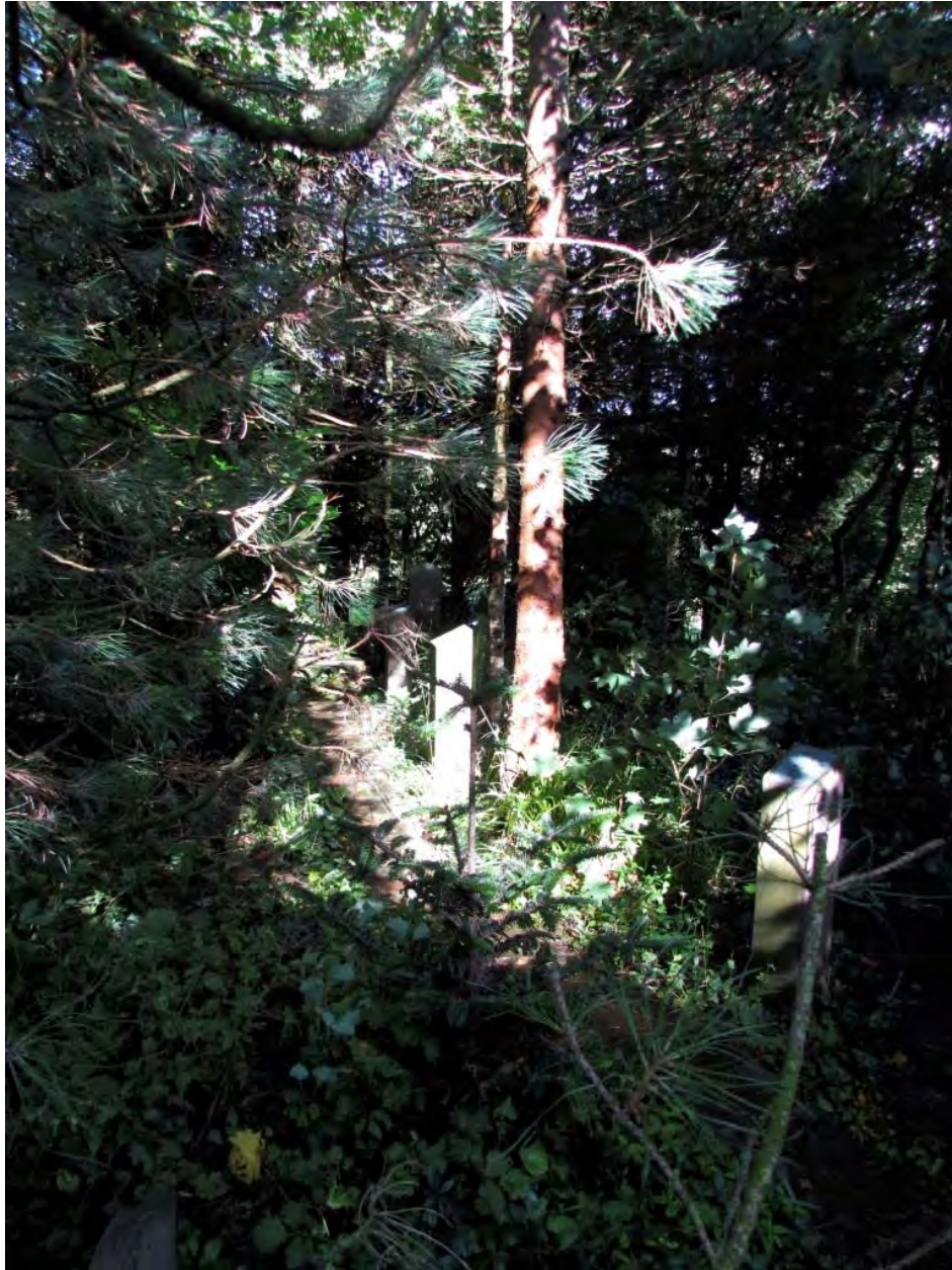
Figure 1. By courtesy of the Estate of Ian Hamilton Finlay. Photo by Kathleen McKay.

cooperation will allow us to respect Heidegger's methodological warnings by moving between straightforwardly assertoric and more phenomenological or poetic styles. We begin with Finlay's foundational engagement with Heidegger – with what one might call the Holzwege plinths (Figure 1). 12