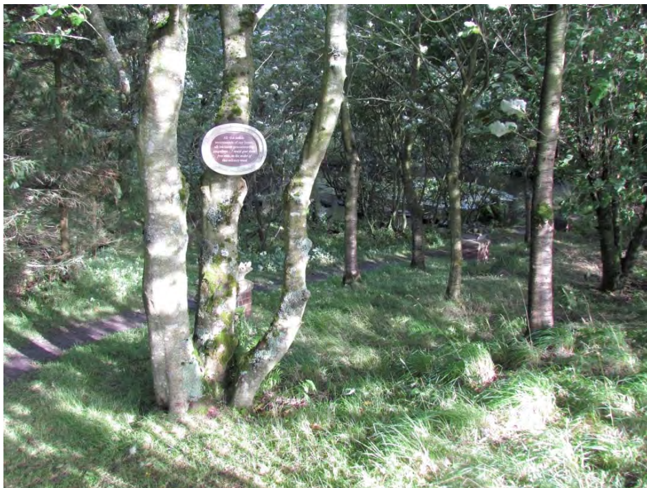
Figure 3. By courtesy of the Estate of Ian Hamilton Finlay. Photo by Kathleen McKay.

Holzweg . Thus it comes to be that Finlay's woodland enacts the poet's task in the world as described by Heidegger: the processes of cutting, disclosure, and establishment of dwelling deliver the revelation promised in the Holzwege inscription. The artwork establishes a foundation stone that functions as a joint in thought, allowing a wider field to unfold in accordance to the object. The cohering operation it performs on the wider garden is not achieved by introducing some new or external model of unity but rather, as Heidegger identified, by making visible connections that already belong to the gathered nature of the object. The poet's thought there dwells and by that dwelling gains a deepening hold on the ground, answering Heidegger's call "to bring dwelling to the fullness of its nature." 40 We may find this in the poet's expanding territory, in the more tightly wrought bent of paths in the established garden, and in the flattened areas of earth around an artwork, where approaches gather. It is by poetry's nature that this progressive dwelling develops: "poetry that thinks is in truth / the topology of Being." 41 With each persistent mark on wild land, the garden's poetic scope and potential territory enlarge. To the forest keeper and poet, the woodland is now increasingly bound to disclose. Thus the larger artwork of Little Sparta begins to emerge – and with it Finlay's conception of being in the world.