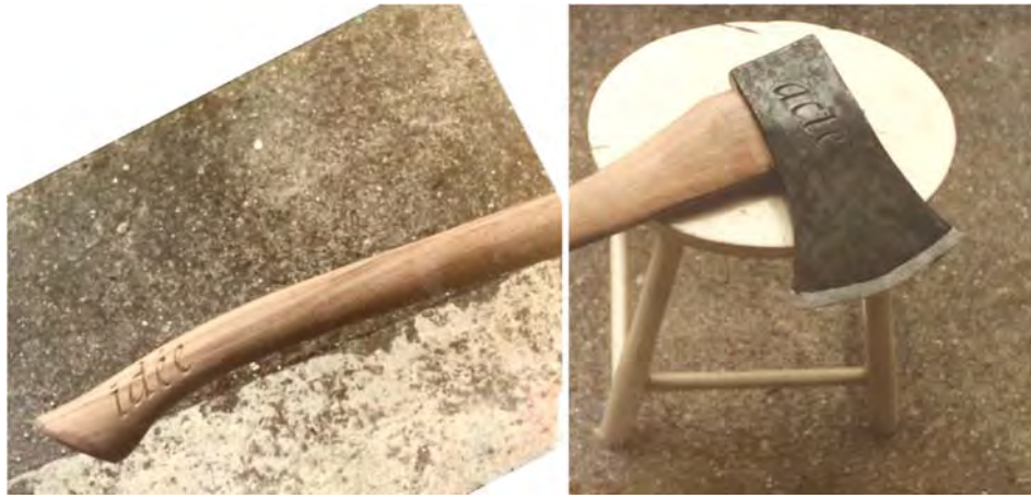
Figure 2. Photo by John Andrew. Courtesy of the artist.

The violence and clarity represented by Finlay's axe – an archaic weapon and deforesting technology – manifest what Heidegger called “repetition”: a return to the past to identify resources that one might use to determine the present. 29 Here the object, the axe, functions as a tightly gathered form that inherently retains its cultural position. This upholds a class of object in the vein of those made by Daedalus – a classification that was dominant in early Greek thought and which Heidegger echoed in his description of the object as a gathering point of sense. This type of object – a daidalon – was asserted wholly, a persistent gathering: a highly wrought form in which the object's exterior appearance was consistent with its inbound purpose. Objects made in this vein could be swiftly and decisively redeployed by Finlay, their purpose having remained vital. In Finlay's garden setting, figures such as Saint-Just make way with these instruments and tools, cultivating the ground assertively, forcibly even.